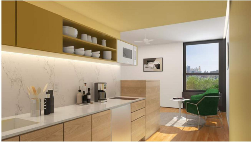
Interior of Renaissance Center Glavovic Studio

The project may be the first modular high-rise in the City of Los Angeles, but it is not the first to combine high-rise construction with affordable housing. The Weingart Center has partnered with two developers on 17- and 19-story towers now under construction just north at the intersection of 6th and San Pedro Streets.