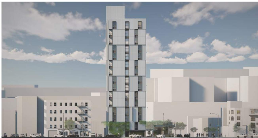
7th Street elevation for Renaissance Center

Architecture firm Glavovic Studio sends work that construction is set to commence in June 2024 for the Renaissance Center, a affordable housing development at 423 E. 7th Street in Skid Row . The privately-funded project, expected to cater to very low- and extremely low-income households, will consist of a 15-story building featuring 216 micro unit apartments ranging from 280 to 322 square feet in size.